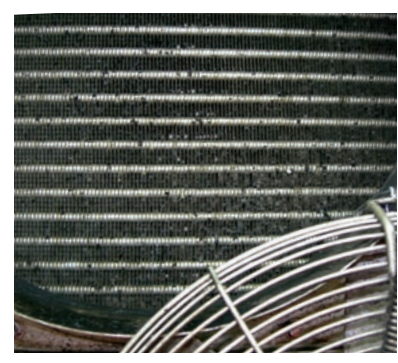
Air on: prior to AerisGuard* treatment

Post trial location samples showed no fungal growth or growth at the detection level of a single colony (less than 421 CFU/m²).