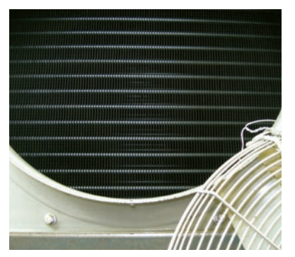
Air on: post AerisGuard* treatment